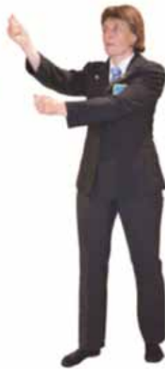
Penalty for Cross one side gripping