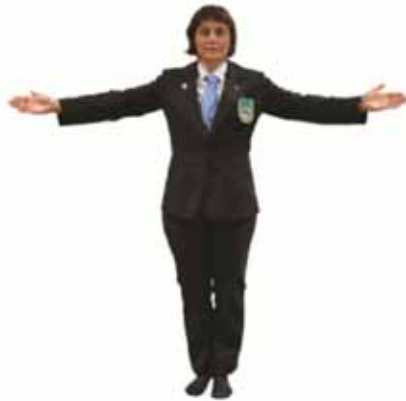
Inviting Contestants on the tatami