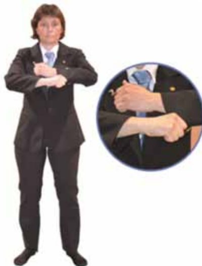
Penalty for fingers inside sleeve