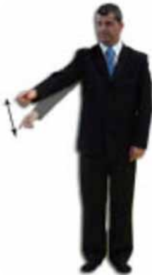
Shido for stepping outside