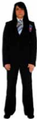
Standing before the fight