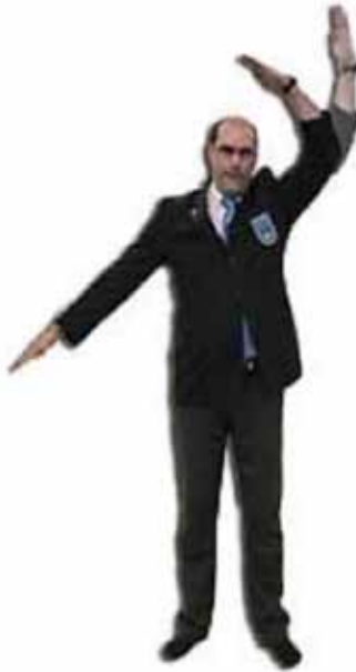
To Cancel expressed opinion