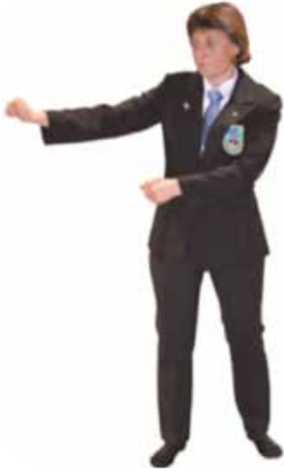
Penalty for Blocking Attitude