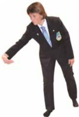
Penalty for leg grabbing