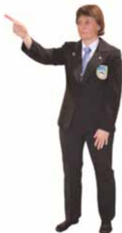
Awarding a penalty