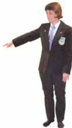
Penalty for stepping outside