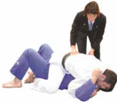
Sono-Mama \Leftrightarrow Yoshi