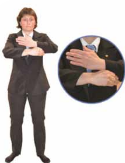
Penalty for pistol grip Pistol grip action