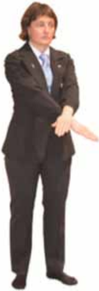
Adjustment of Judogi