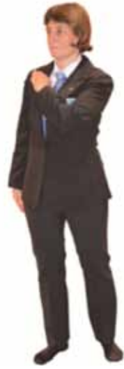
Penalty for refusing kumikata pulling label