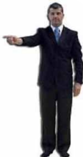
To award a penalty