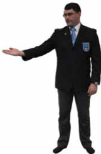
To call the doctor